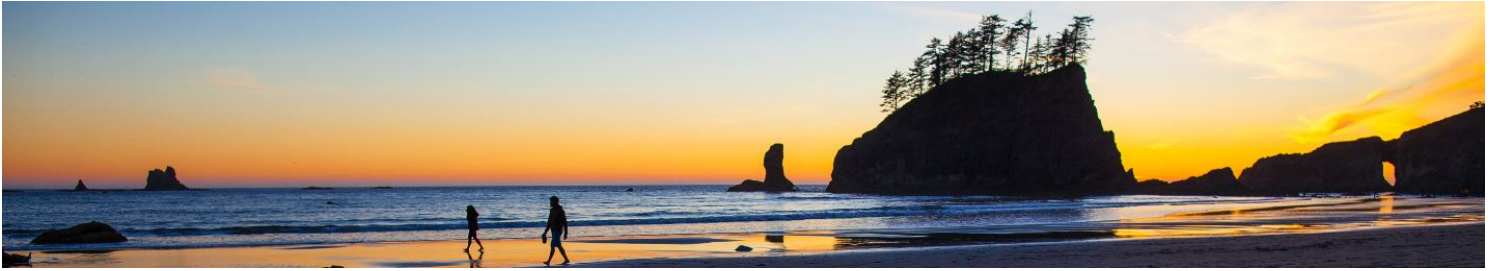
Sunset in Olympic Coast National Marine Sanctuary.