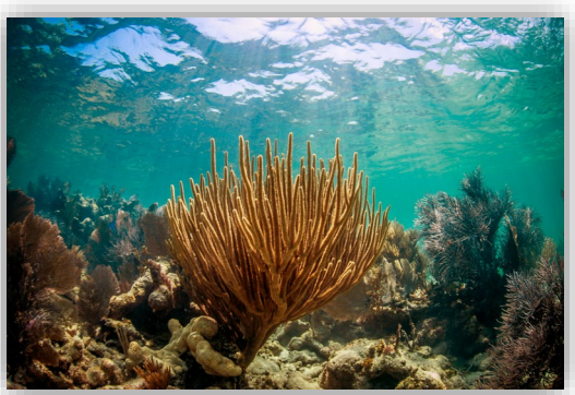
Coral reef protected in Florida Keys National Marine Sanctuary.

Intertidal habitat protected in Monterey Bay National Marine Sanctuary.