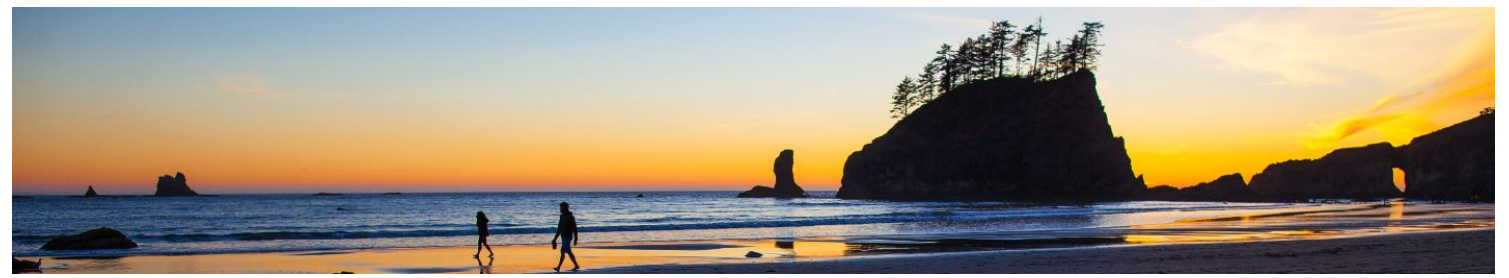
Sunset in Olympic Coast National Marine Sanctuary.