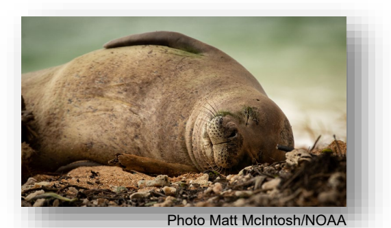
Hawaiian monk seal in Hawaiian Islands Humpback Whale National Marine Sanctuary

Effective MPAs should have legally established goals and conservation objectives. Common examples include MPAs created to conserve biodiversity in support of research and education and to protect and interpret shipwrecks for maritime education. These descriptors of an MPA are reflected in the site's Conservation Focus, which represents the characteristics of the area that the MPA was established to conserve. The Conservation Focus, in turn, influences many fundamental aspects of the site, including its design, location, size, scale, management strategies, and potential contribution to surrounding ecosystems. U.S. MPAs generally address one or more of these areas of Conservation Focus: